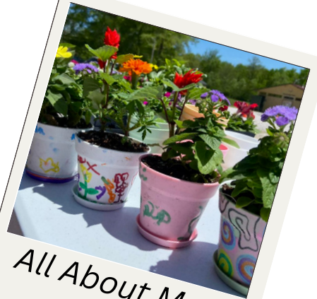
All About Mom