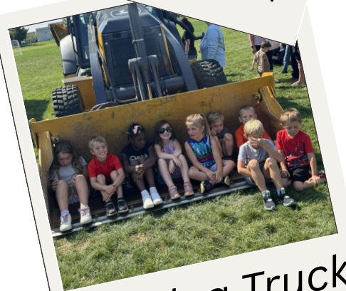
Touch a Truck