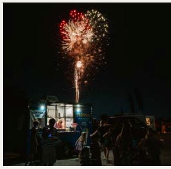
Red, White & Boom