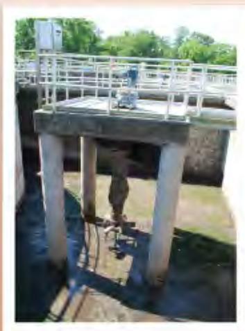
Photo 3 – Material on impeller blades create an unbalanced condition that leads to destructive vibration through gearbox and motor.

Photo 2 – Close up of rag material hanging on mixer shaft.