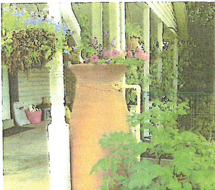
Decorative rain barrels with "planter tops"