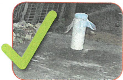
Septic tank ventilation pipe with screen mesh