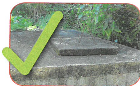
Septic tank with concrete cover