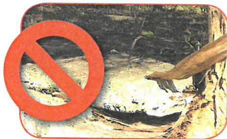
Repair broken septic tank covers