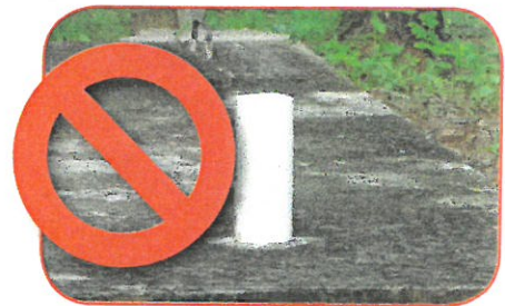
Cover ventilation pipes